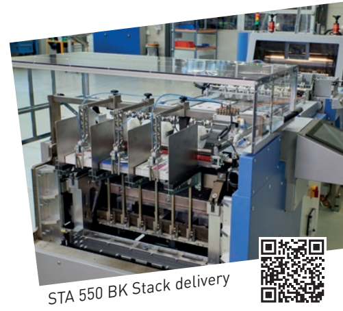
STA 550 BK Stack delivery

Your printed matter deserve the best, and that's exactly what BOGRAMA delivers!