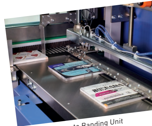
Cross Conveyor to Banding Unit